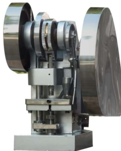
TDP-5 Single Punch Tablet Press