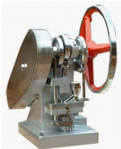
TDP-1 Single Punch Tablet Press