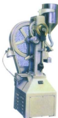
THP-4 Flower Basket Tablet Press