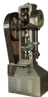
THP-10 Flower Basket Tablet Press